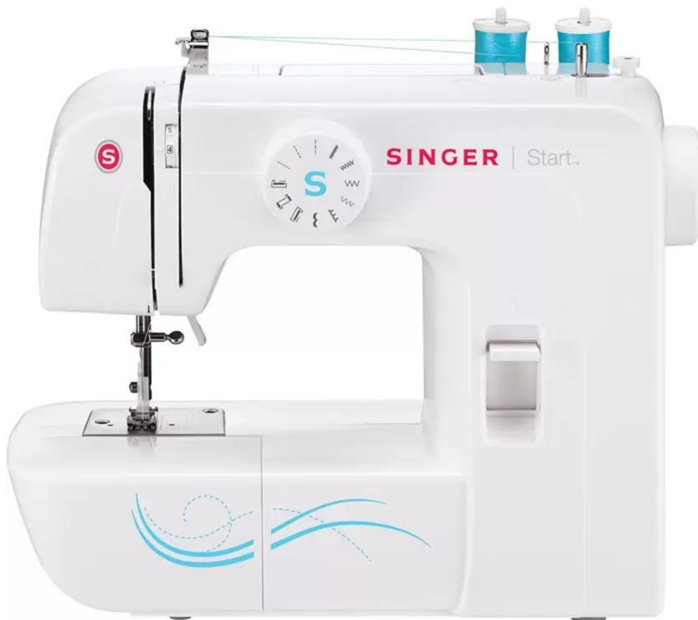
Singer 1304 Start Sewing Machine