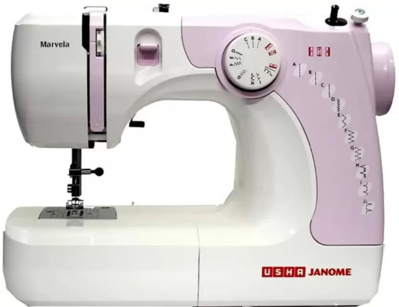
Marvela Pink Usha Janome Sewing Machine