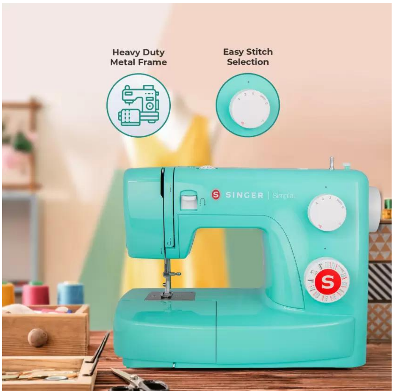
Singer FM 3223