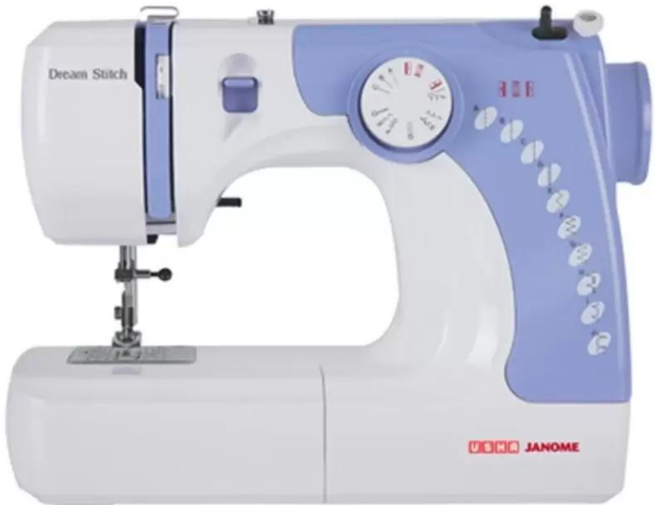
Dream Stitch Usha Sewing Machine