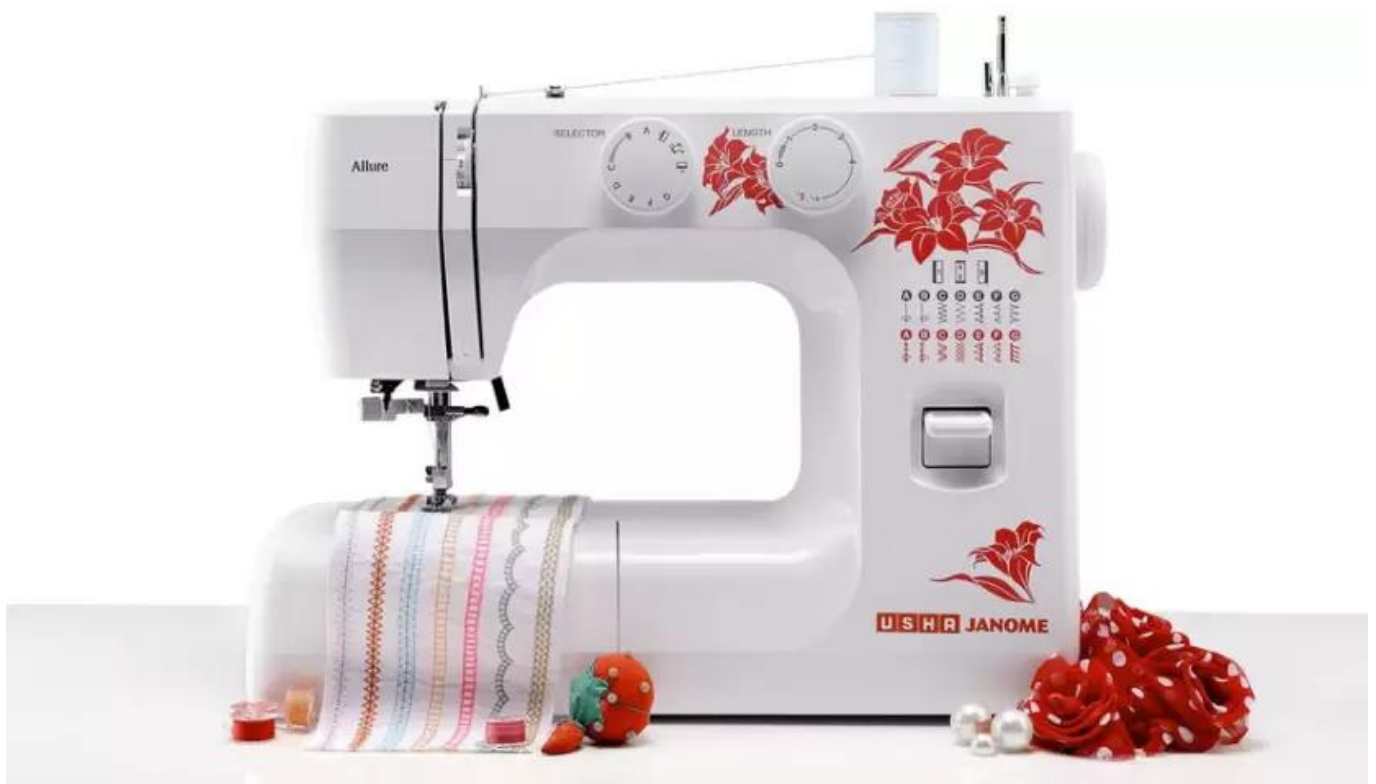
Usha Allure DLX