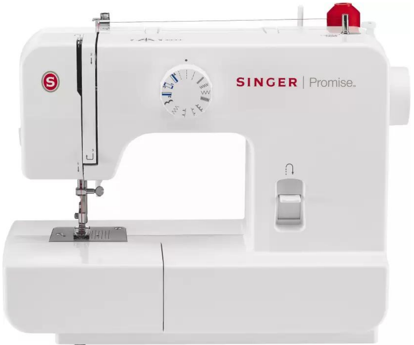
Singer Promise 1408 Sewing Machine