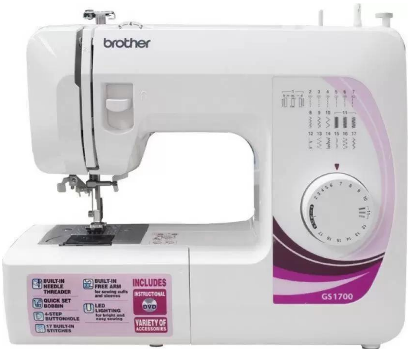
Brother GS 1700