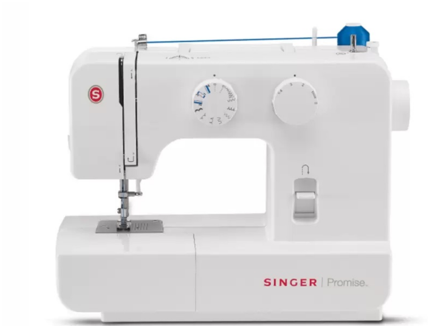
Singer FM 1409 Sewing Machine