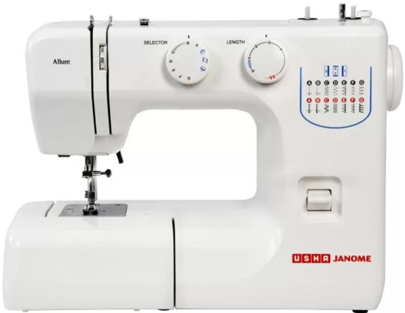
Usha Janome Allure