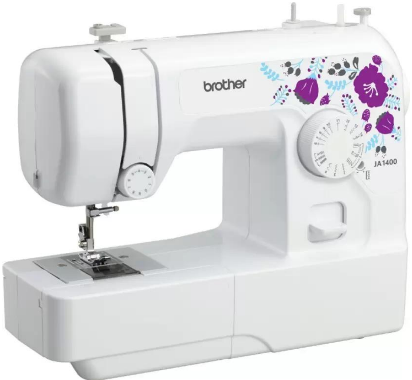
Brother JA 1400

In the same price range, this sewing machine has the potential to stand out among Singer and Usha models. However, I'll let you make the final call based on your needs and the features offered. The Brother JA1400 is a compact and user-friendly machine tailored for sewing and mending tasks. Boasting 14 built-in stitches, a 4-step buttonhole, and convenient features, it ensures a hassle-free sewing experience. Now, let's delve into the essential features and specifications of this reliable sewing companion.