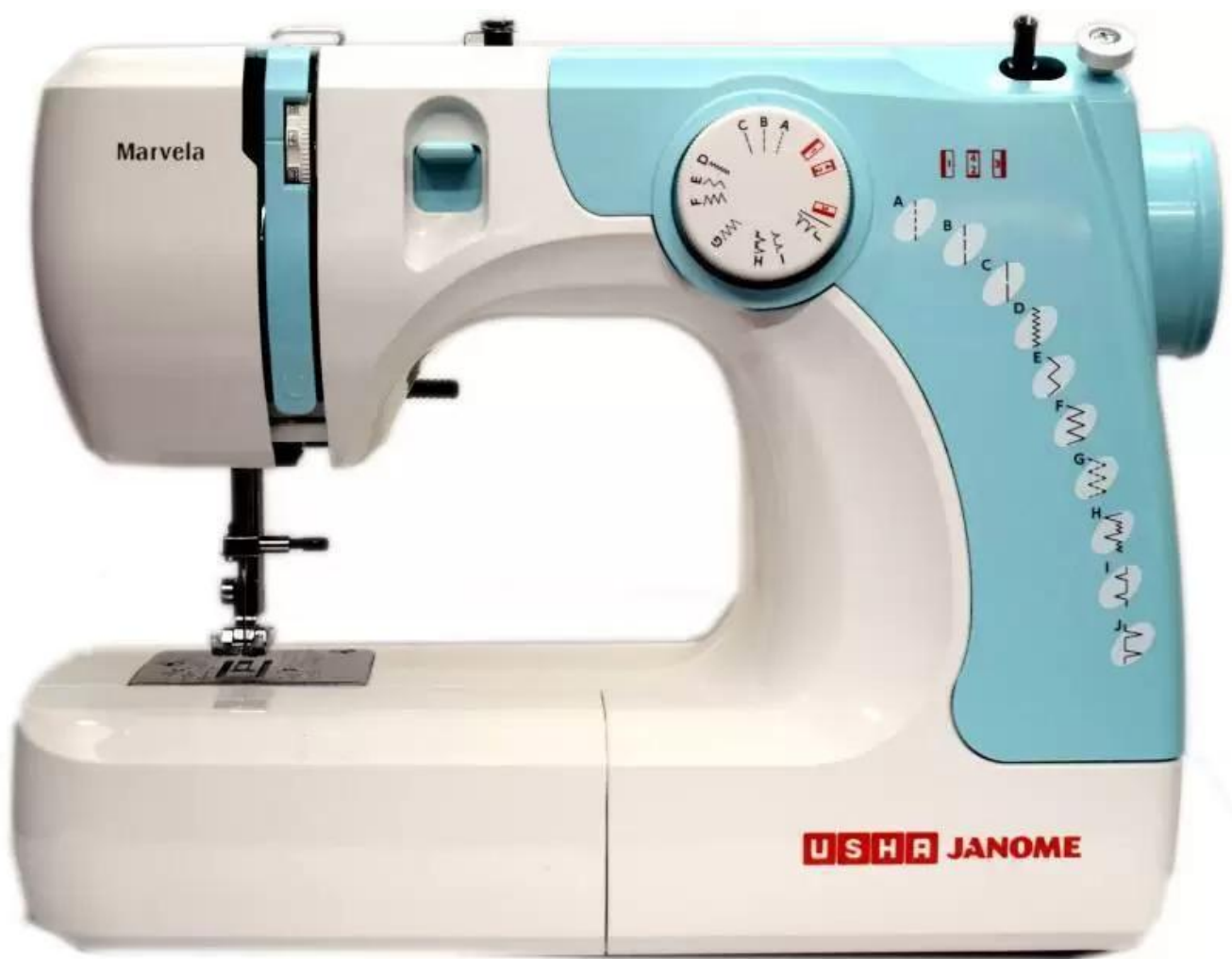
Usha Marvela Blue Janome Sewing Machine