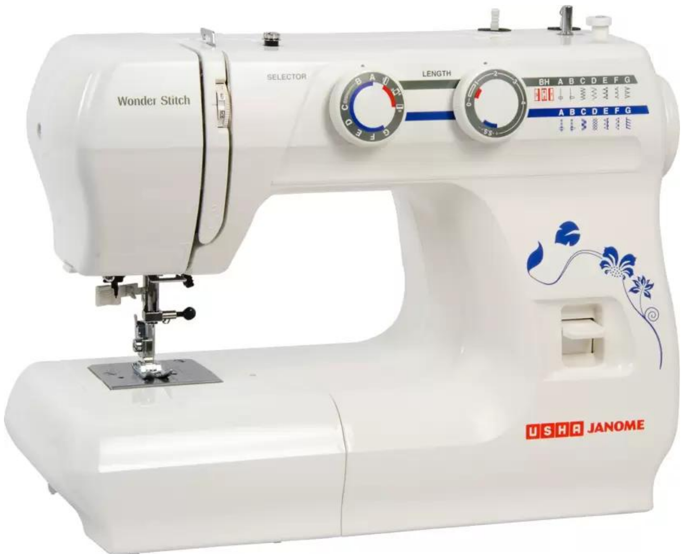
Usha Wonder Stitch