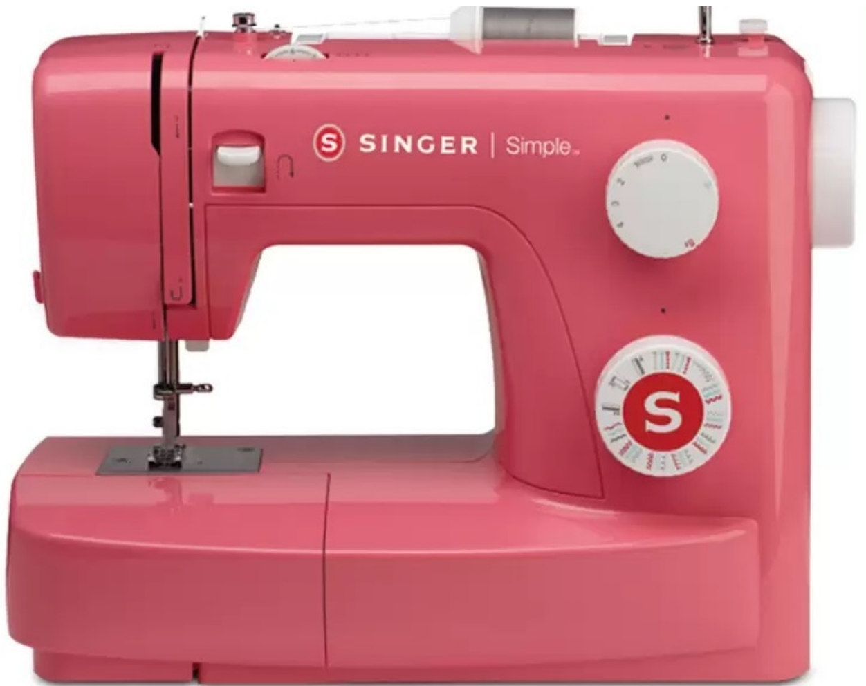
Singer Fashion Maker 3223

decorative sewing, it caters to all your sewing projects with its 23 built-in stitches and many features.