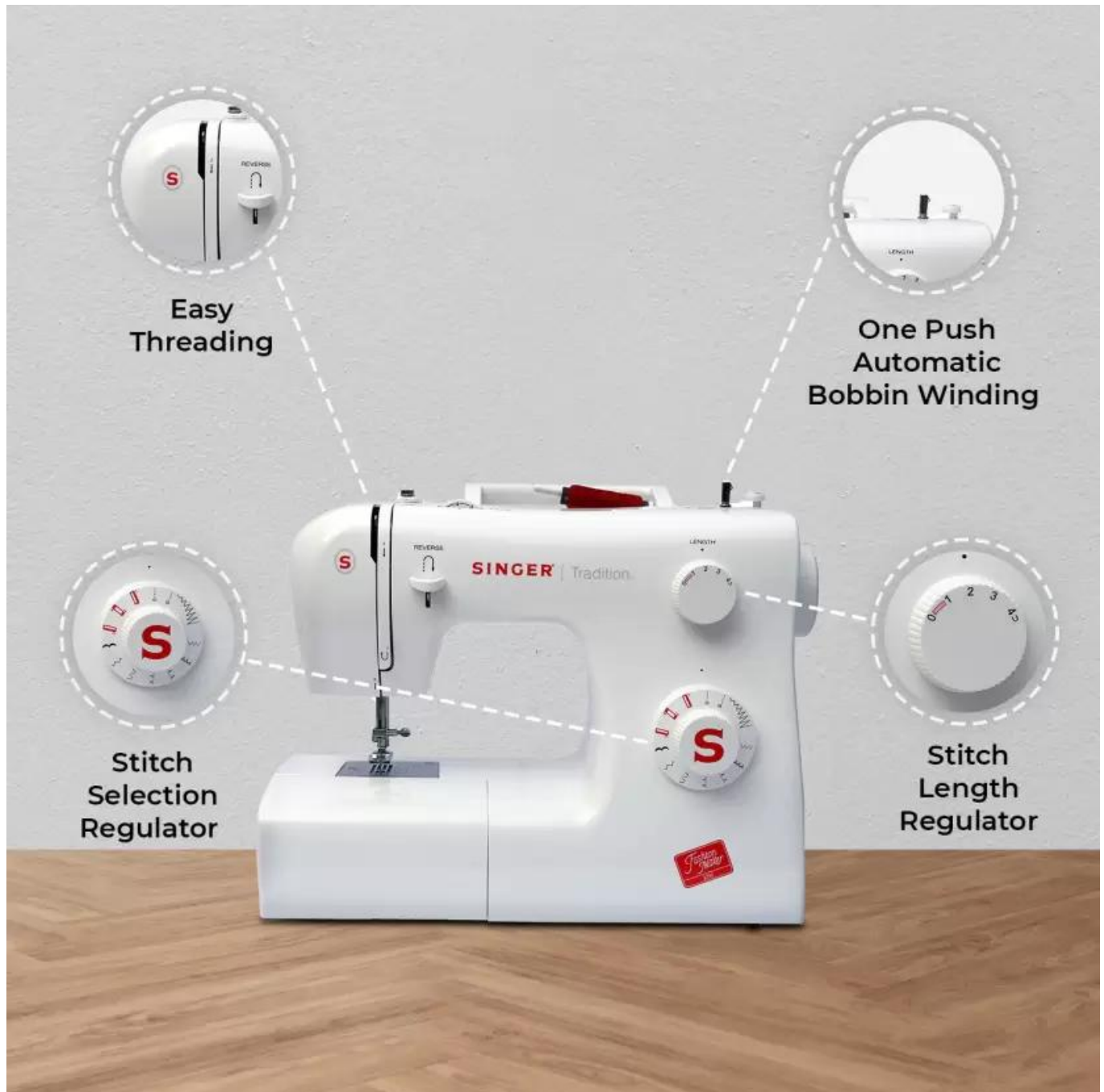
Singer FM 2250 Electric Sewing Machine

10 Built-in stitch. Indulge in the joy of creating beautiful frocks for your little one, fixing shirt buttons, and stitching stunning cushion covers with the Singer 2250 Tradition sewing machine. Again, another excellent sewing machine from Singer within budget makes it the best choice as a sewing machine for home use. This versatile machine allows you to let your imagination run wild and brings your sewing projects to life effortlessly.