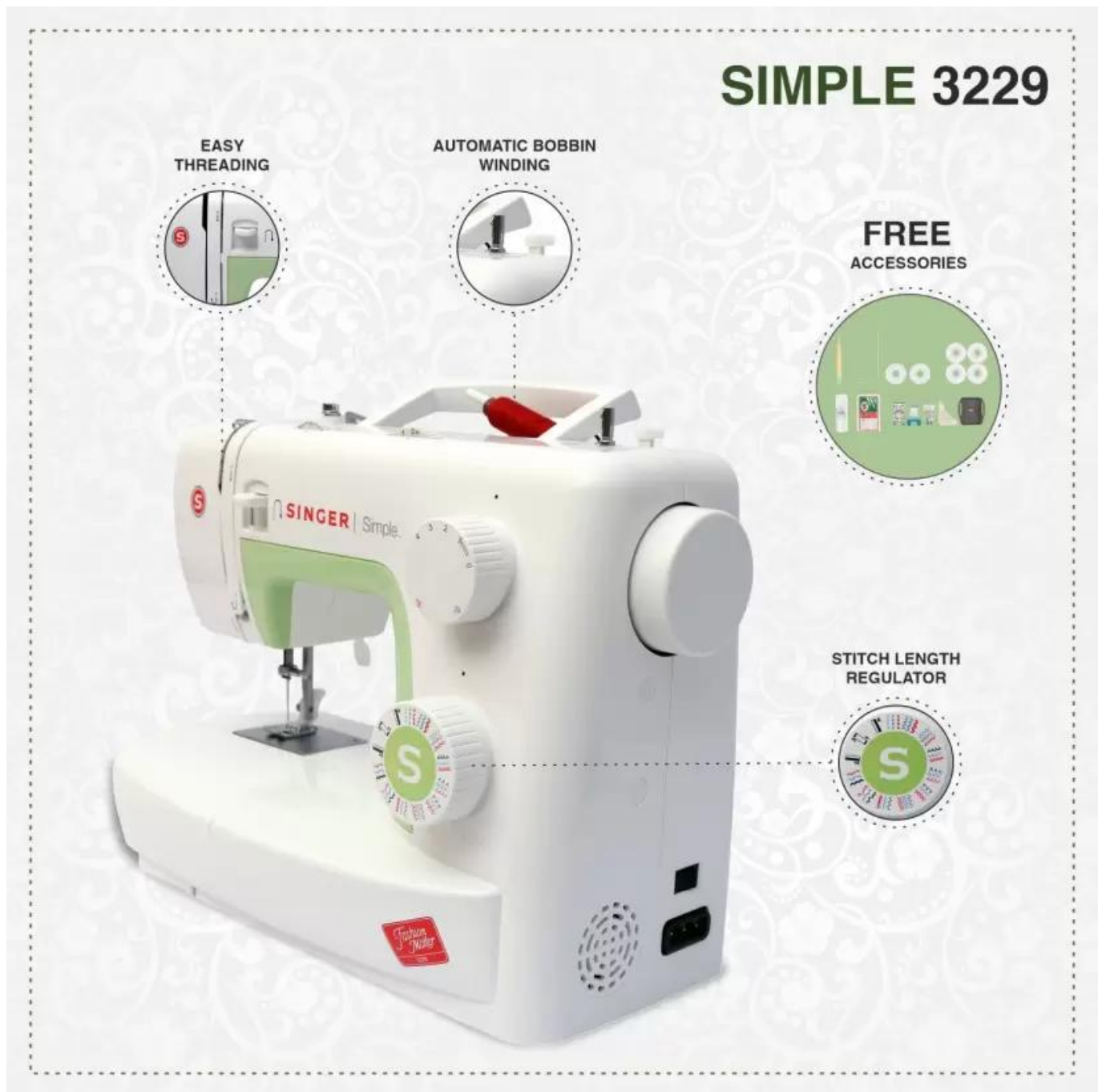
Singer FM Simple 3229