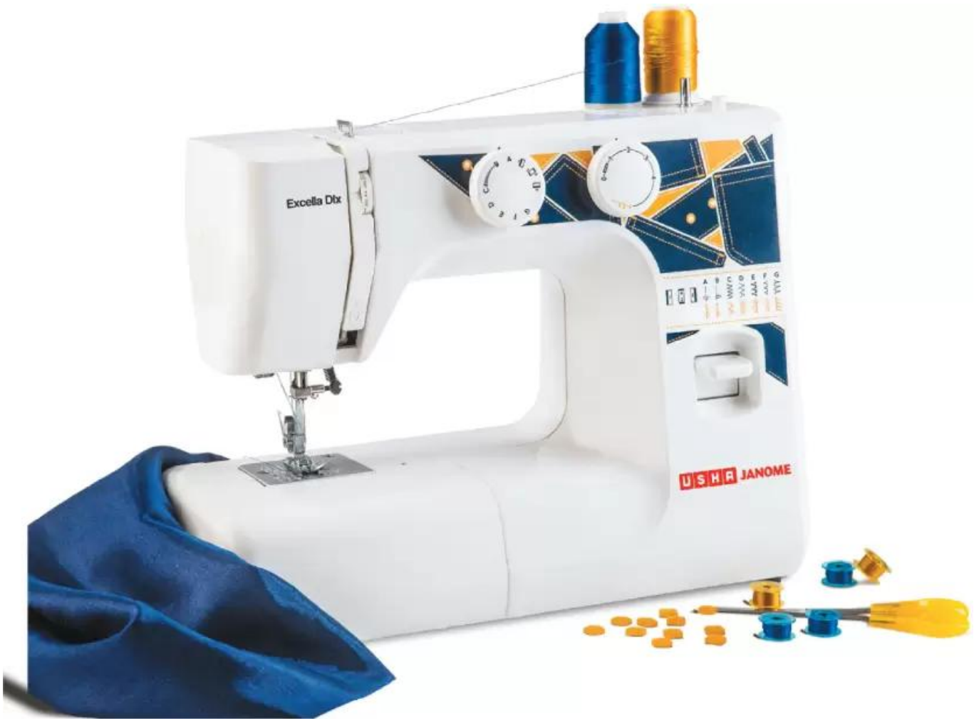
USHA EXCELLA DLX Electric Sewing Machine