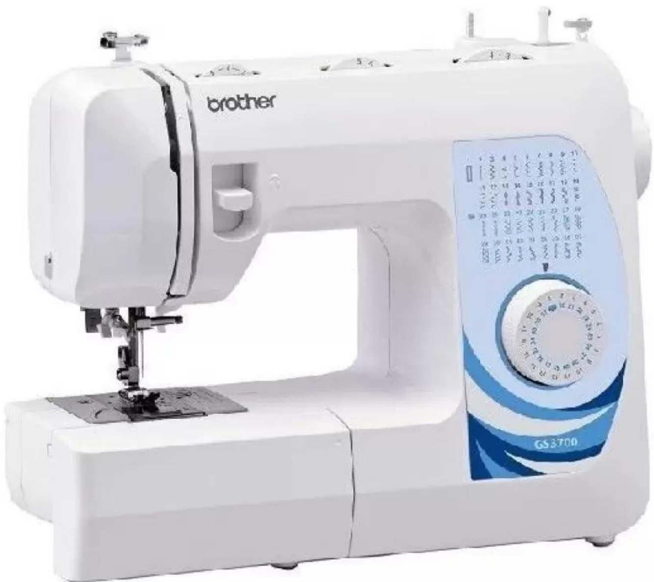
brother GS 3700

The Brother GS-3700 traditional sewing machine is a versatile and user-friendly device designed to cater to various sewing needs, from repairs to dressmaking and home furnishing projects. Let's delve into its features and specifications to understand how it can enhance your sewing experience.