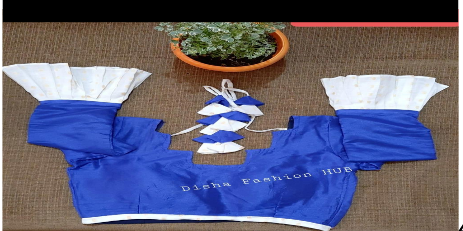
4. Work with Disha